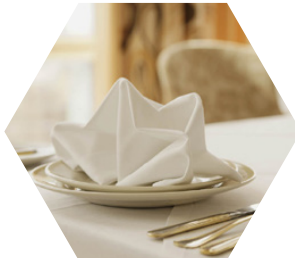
Uniforms, linens, and textiles