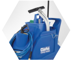
Cleaning and sanitation supplies and services