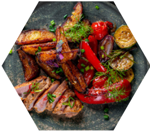
Food programs including regional, specialty, wellness and sustainable offerings

Foodbuy manages over 40,000+ contracted products and services with 450+ leading manufacturers. We are continuously expanding our portfolio to provide greater options and benefits for our members.