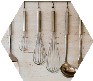
Smallwares, disposables, appliances