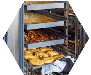
Appliances, equipment, and furnishings